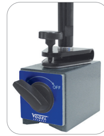
fine adjustment at the magnetic base