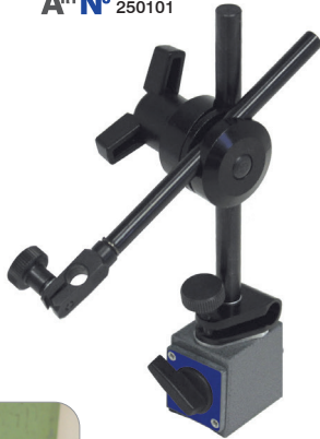
ART N° 250101