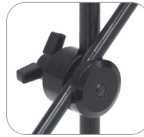
stable clamping with rotary handle