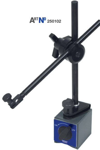
ART N° 250102